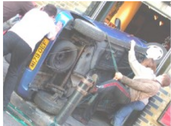
In 2005, a production of Lysistata required cars on stage. Solution: cars entered through the front lobby, dragged by volunteers. We didn't even scratch the paint.

Early shows were often lit by candles because of a shortage of stage lights. Productions rested on sweat and dedication. There were no feasibility studies, no consultants, no two-stage funding applications: just black paint, and a lot of volunteers accomplishing the highly improbable. Our early successes were fuelled by the belief that anything is possible.