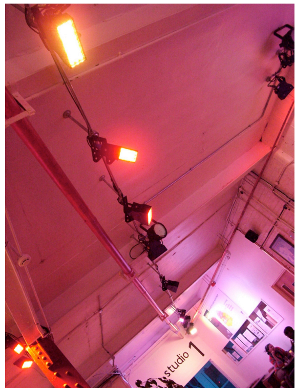
In 2008, front-of-house lighting is powered by an in-house hydrogen-fuel-cell system.

Now, with the founding of Arcola Energy, we are prepared to turn our ethos of "an open door and endless possibilities" to the pressing need for sustainability in the arts : first with the London theatre sector, then the UK, and eventually on a global scale.